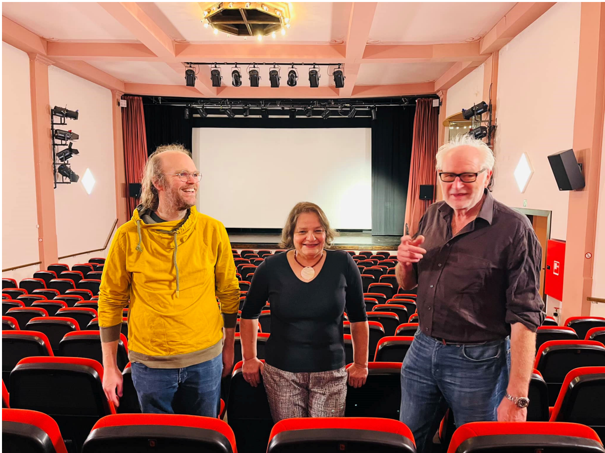
Illustration 2 Composer, producer, and director at the premiere in Eupen