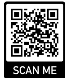
Illustration 9 Wolfgang DELNUI

To understand the composition of the piece Shifting Consensus , it is important to know more about the composer, Wolfgang DELNUI. You can find more information about him behind the QR code [Text unfortunately only available in German]. Think about why he might have composed this piece.