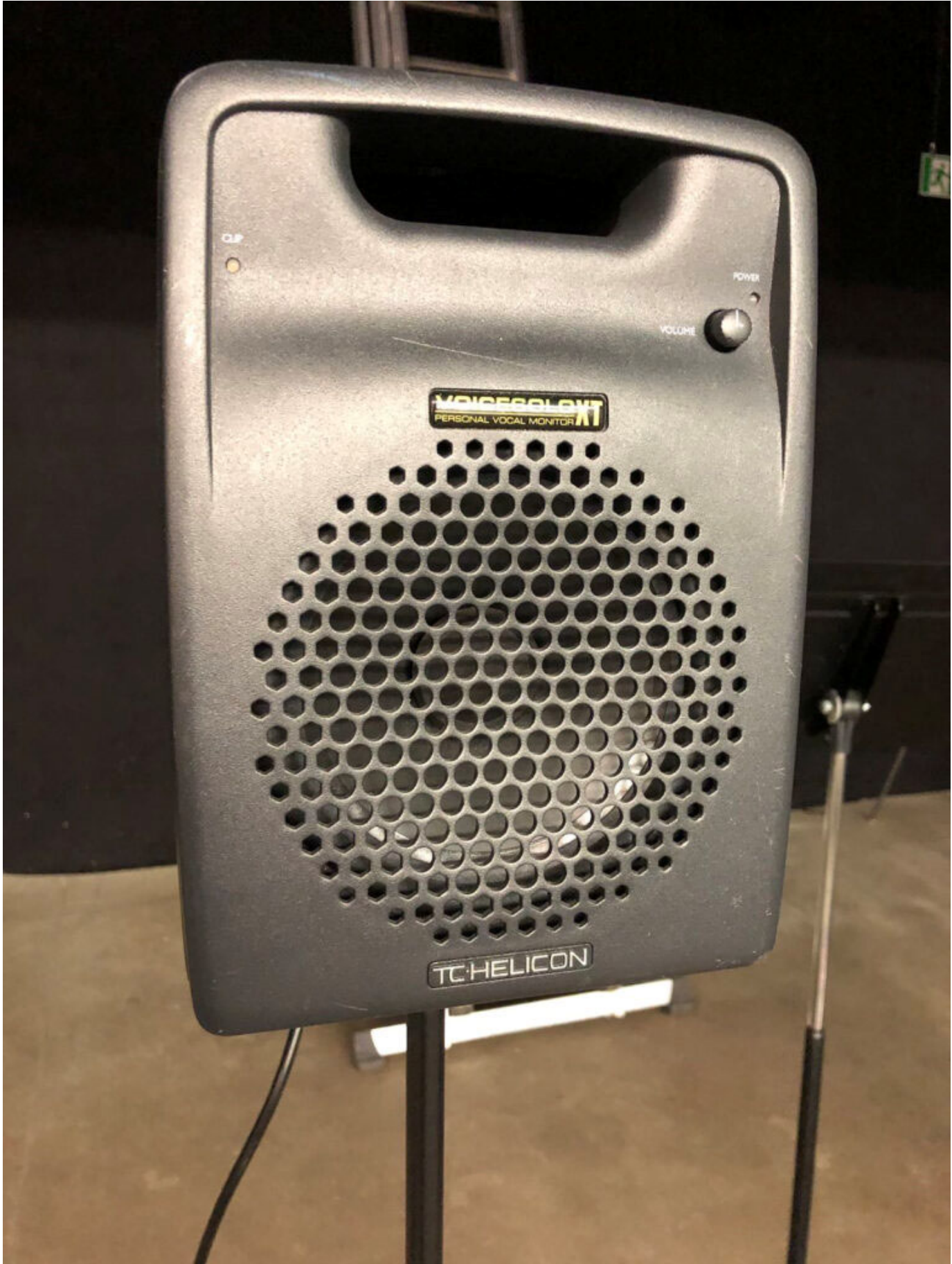
Illustration 6 The loudspeaker