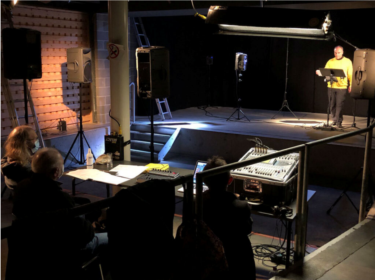
Illustration 8 Filming at the Alter Schlachthof